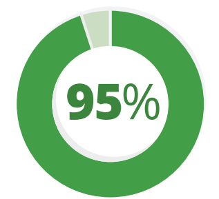
95% said they would recommend this training to others* *Based on CareerSafe course exit surveys

Learn more about the CareerSafe OSHA 10-Hour General Industry (Manufacturing) course »